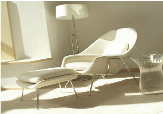
Low angle tilt allows a fresh view of planks.