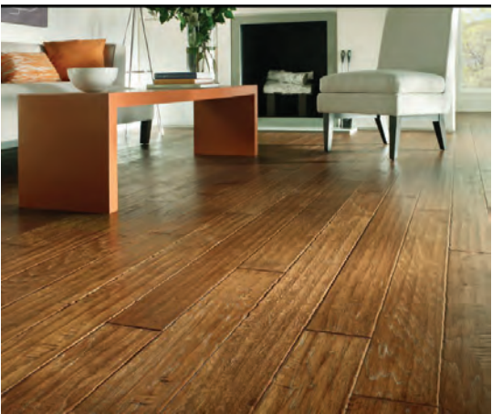
Dog's view shows surface texture.