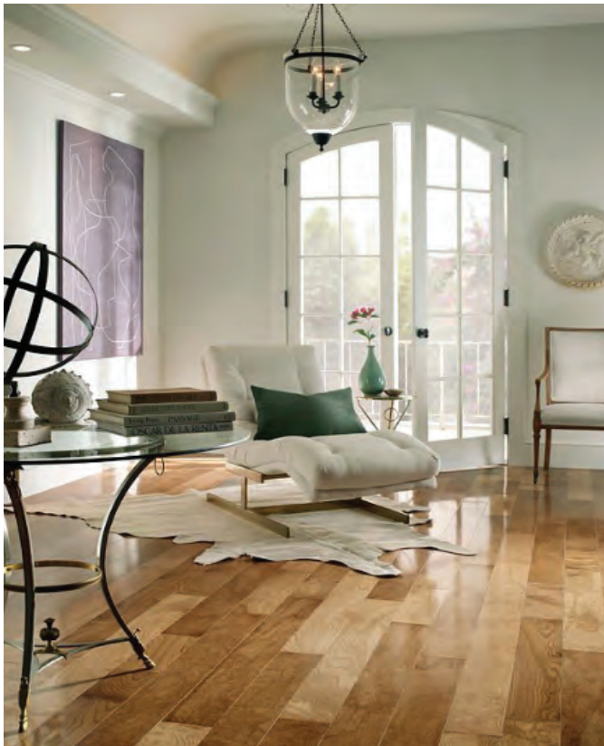
Standard Angle shows the way the floor works in the overall room environment.