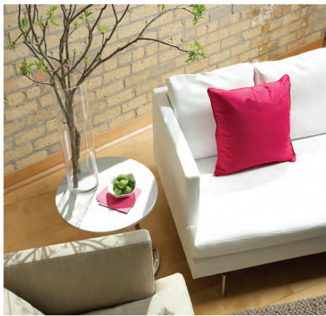
High angle vignette - closer view of color and plank variation.