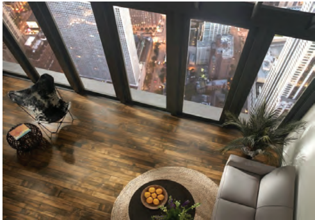
Bird's eye view - shows color and plank variation as it works in the environment.